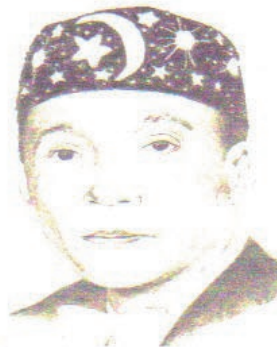
The Honorable Elijah Muhammad Messenger of Allah

gifts of appeasement such as equality, freedom, civil rights, jobs and political opportunities are temporary pacifications and the false hopes of a promising future of being incorporated into his (con't pg3)