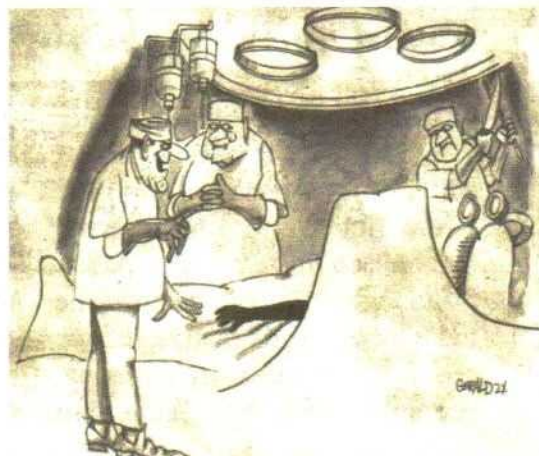
"WE AMERICANS ARE FORTUNATE... IT'S NOT EVERY NATION THAT GETS A CHANCE TO OPERATE ON ITS ENEMY."