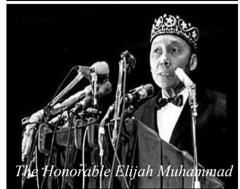
The Honorable Elijah Muhammad

October – The birth of our Divine Leader, Teacher and Guide. The Messenger of Allah