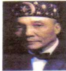
The Honorable Elijah Muhammad Messenger of Allah

Wisdom” Volume 1, on pages 17-18, Messenger Elijah Muhammad addresses this subject. Though the Honorable Elijah Muhammad explores many aspects of the works and mission of the man of sin . We, this time, are mainly interested in the express identity of the man of sin . It has been stated that a tree is known by the fruit that it bares; thus, the more we learn about the nature of the tree, the more we can learn what to expect