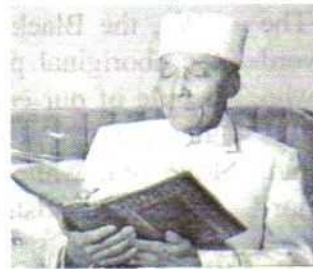
The Honorable Elijah Muhammad Messenger of Allah

people marks the Judgment of the righteous and the wicked. The Holy Qur'an is mostly directed to the so-called Negro, the lost-found members of their nation. It is to acquaint them (cont' pg 2)