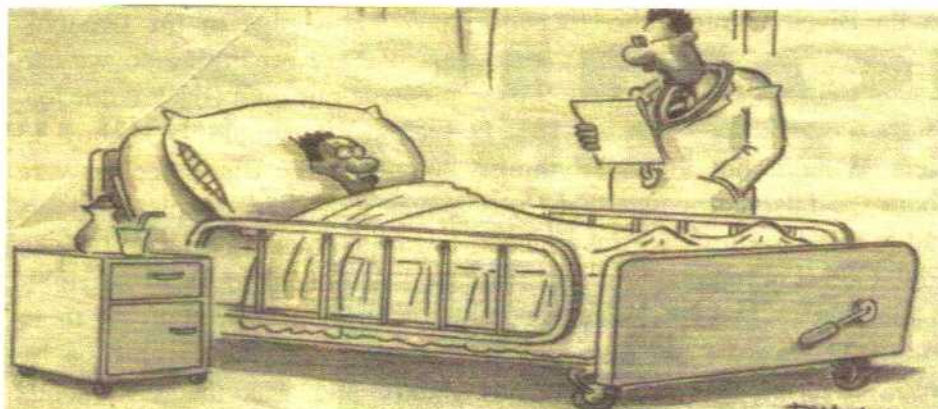
"YES, POLICE BRUTALITY IS AN EPIDEMIC IN OUR COMMUNITY, BUT WHAT'S KILLING YOU IS PORK—THE OTHER WHITE MEAT!"