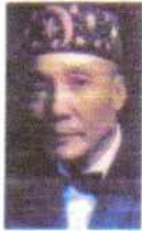
The Honorable Elijah Muhammad Messenger of Allah

Visit Muhammad's Temple of Islam # 24 1318 Mosby St. Richmond, Va. 23223 804-649-7103 Regular Meetings Sundays at 2:00 pm