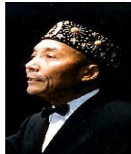
The Honorable Elijah Muhammad Messenger Of Allah

ings of Islam by the Honorable Elijah Muhammad, the Last Messenger of Allah, Master Fard Muhammad, Who is God in Person, no longer aspire to the concept of heaven being possible after a physical death. The question of heaven being available after a physical death has been answered with clarity. The answer is there is no heaven to be had after a physically death no matter what type of life that is or was lived before the