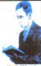
Master Fard Muhammad Allah In Person

Temple #41 in Bridgeport, Ct. at 1-203-374-7037 or Temples listed at MUHAMMADSTEMPLE24.org For Hotel Reservations Call Ramada Inn 1-203-375-8866 225 Lordship Blvd. Stratford, Ct. 06615 (Use Code MT41) Less Than Ten Minutes From Conference Location