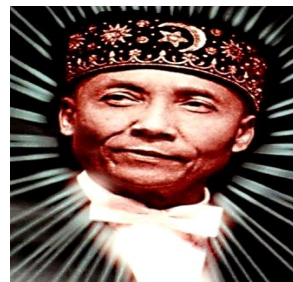
The Honorable Elijah Muhammad Messenger Of Allah

In his book titled, “The Fall of America” , be-